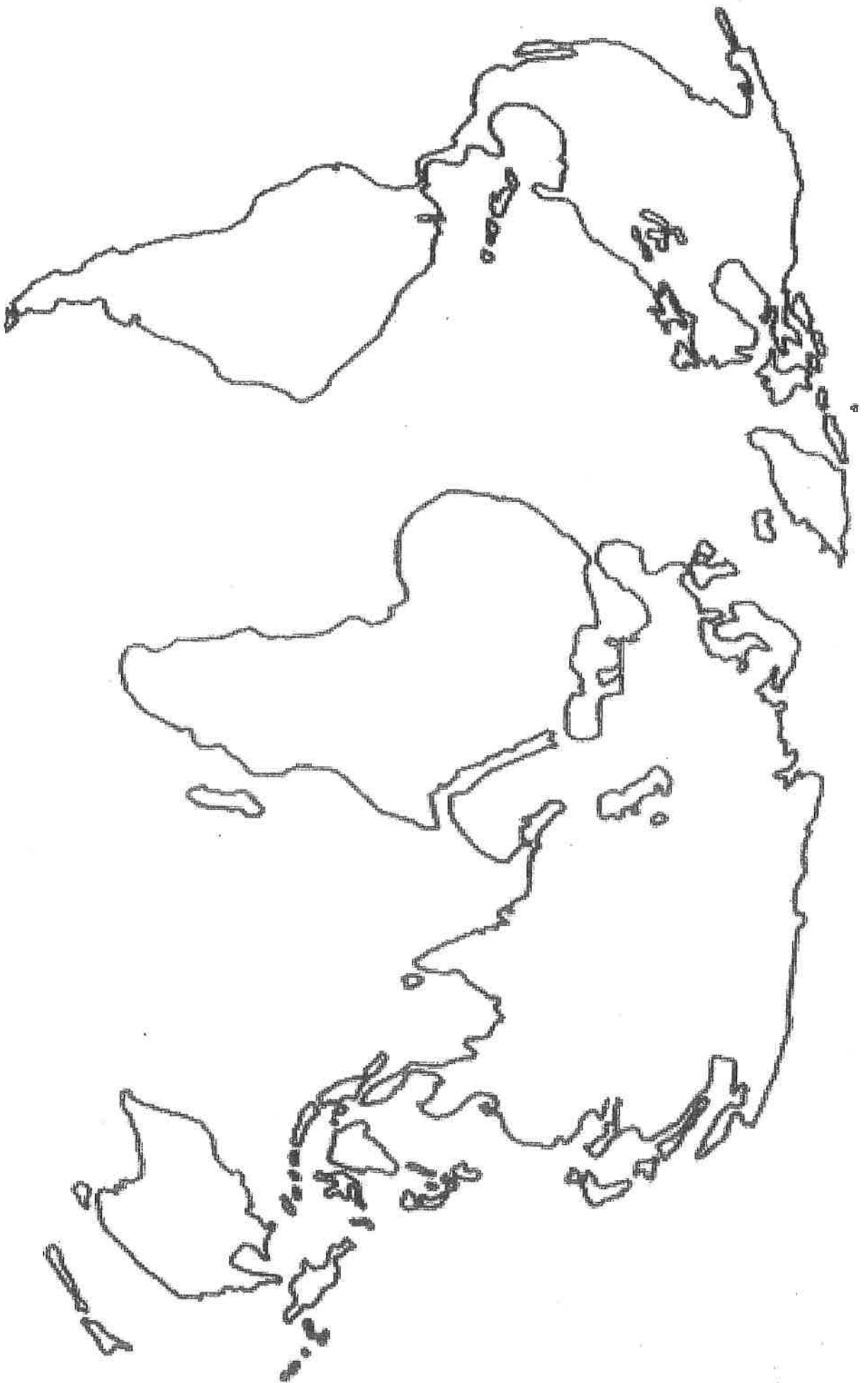
Map of _____'s Route